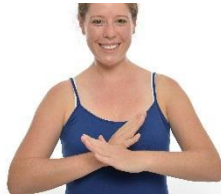
no Spaghetti T-Shirts