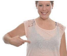
no visible bra