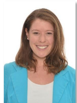
Example pictures (s up/s. down)

The portrait photos shall necessarily be made by a professional Photographers or with the following guidelins . The requirements defined below for lighting, background and technology need to be respected in both cases.