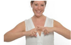
no deep neckline